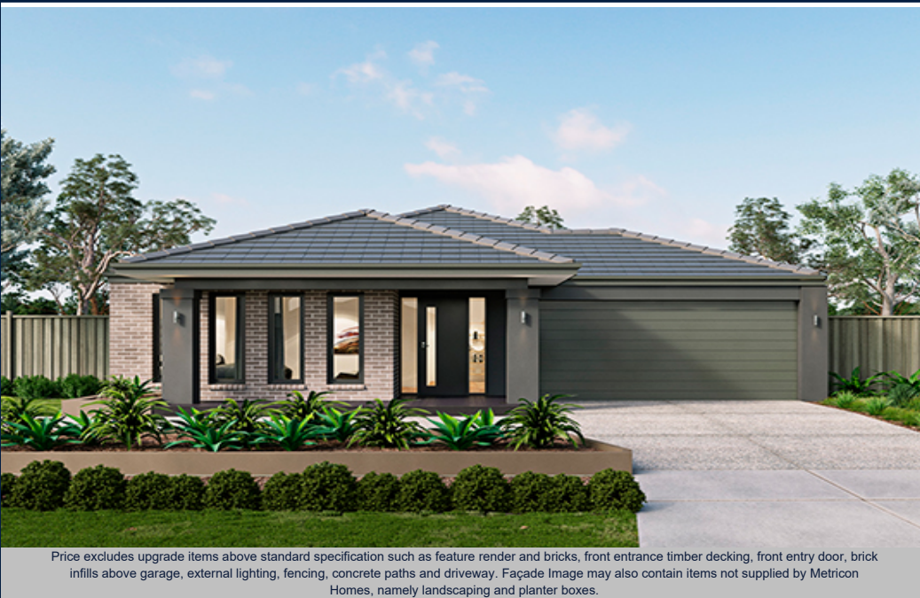
Price excludes upgrade items above standard specification such as feature render and bricks, front entrance timber decking, front entry door, brick in-fills above garage, external lighting, fencing, concrete paths and driveway. Façade Image may also contain items not supplied by Metricon Homes, namely landscaping and planter boxes.