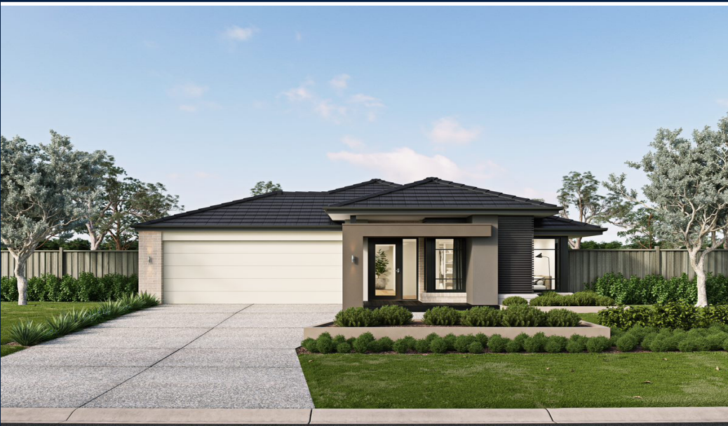
Price excludes upgrade items above standard specification such as feature render and bricks, front entrance timber decking, front entry door, brick infills above garage, external lighting, fencing, concrete paths and driveway. Façade Image may also contain items not supplied by Metricon Homes, namely landscaping and planter boxes.