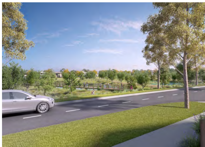
Stage 190A Wetlands Render Artists Impression

Aided by favourable weather conditions over recent months, construction work has kept moving on the ground in The Village precinct, including The Village Wetlands.