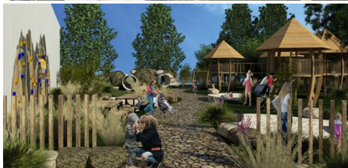
The outdoor playground at the new Manor Lakes Central. All images are artist's impression only.