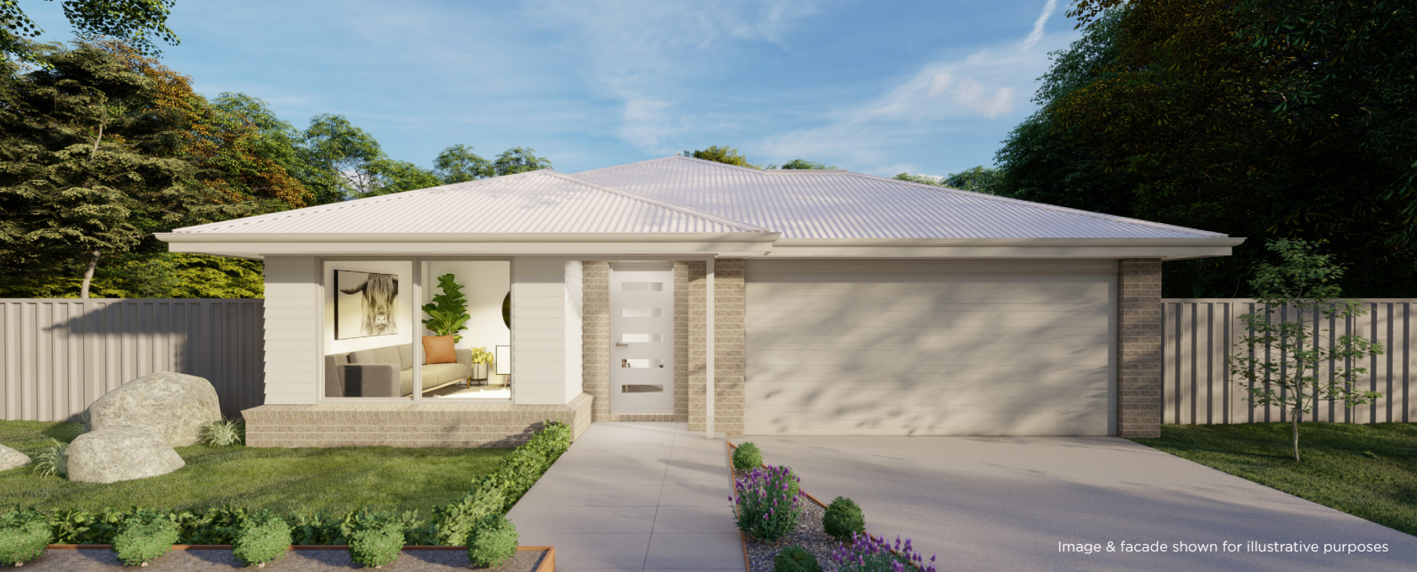
Image & facade shown for illustrative purposes